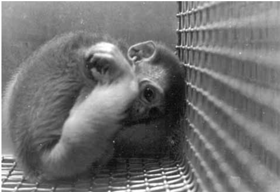
Figure 1. Artificially weaned, single-caged rhesus macaque infant showing typical signs of depression.

Under undisturbed conditions Old World monkey infants are weaned by their mothers at the age of about one year (Hall & DeVore, 1965; Southwick, Beg, & Siddiqi, 1965; Poirier, 1970; Roonwal & Mohnot, 1977). Natural weaning is a gradual process. It implies that the infant, over a period of several weeks or months, is more and more consistently discouraged by his/her mother to suck on her breasts. Once the mother stops nursing the infant for good, the affectionate bond between the two is not broken (Poirier, 1970; Lindburg, 1971; Altmann, Altmann, Hausfater, & McCuskey, 1977; Roonwal & Mohnot, 1977). The young usually remains in the maternal group at least until the age of pre-puberty.